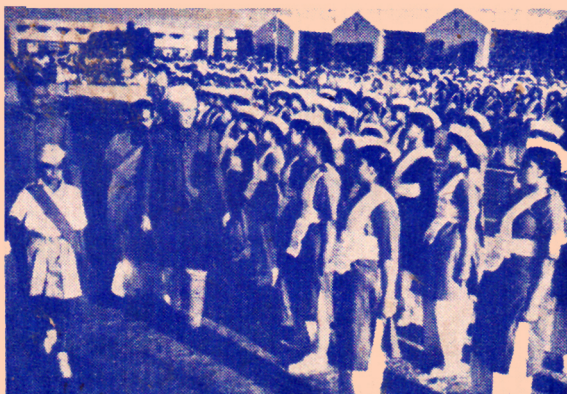
Late Jawaharlal Nehru with Senapati Bhonsle.