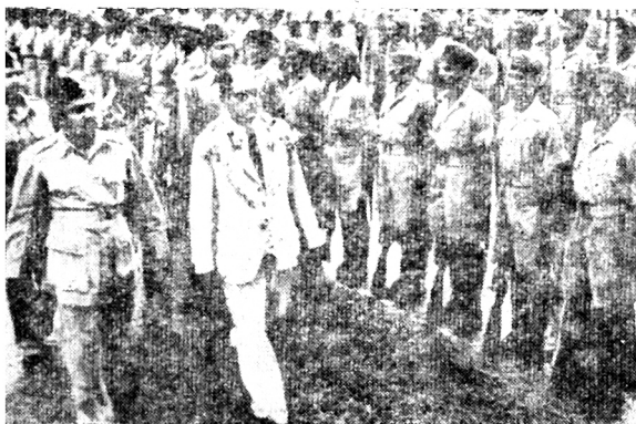
Senapati Bhonsle with Netaji (1943)